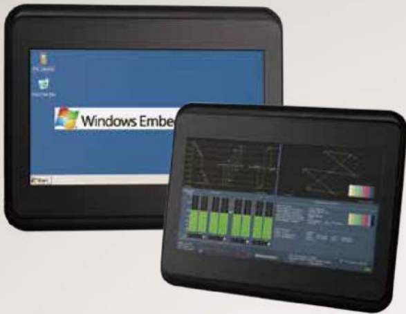
▲ HMI-043T BOX SERIES