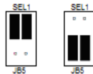
Figure 1: Typical shunt positions.

With both shunts in the lower position, the voltage selected by JB4 will be applied to pin 49 and Port C will be pulled up to that voltage. With both shunts in the upper position, 3.3V will be applied to pin 49 and Port C will be pulled up to 3.3V.