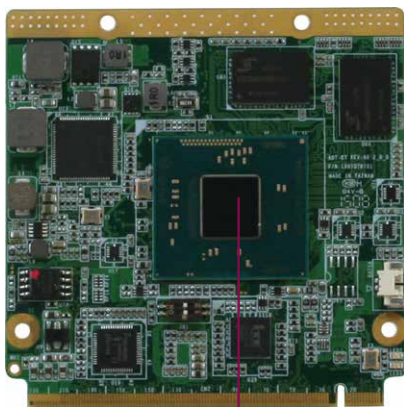
Intel® Atom™ E3800/ Celeron®