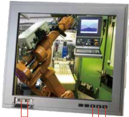
USB x 2 LCD On/Off Brightness + Brightness -

17" Rugged Fanless Touch Panel Computer With Intel® Celeron® 827E/ Core™ i7-2610UE Processor, 2 GB RAM