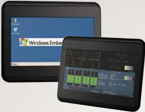
▲ HMI-043T BOX SERIES